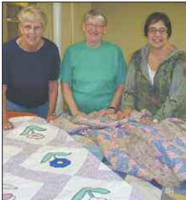
Members of the Berlin Material Girls Quilt Guild are busy finishing their own quilt projects and receiving loans of quilts from members and other local and regional quilters