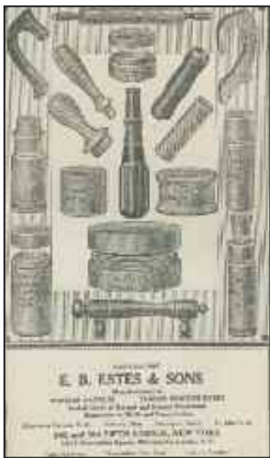
1920 Estes & Son's ad in Berlin-Gorham phone book.